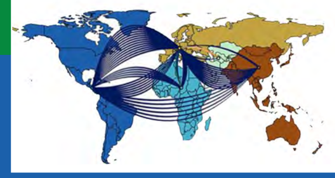
This graphic shows the spatial transmission dynamics of hepatitis B virus genotype E from 1824 to 2014.

Between February and May 2024, researchers within Fogarty's Division of International Epidemiology and Population Studies published the following studies on a variety of topics related to domestic and international health.