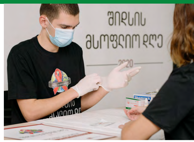
A worker at an HIV testing clinic in Tblisi, Georgia, meets with a patient.

Because so many people with HIV in Georgia go undiagnosed, prevention and treatment methods are underused