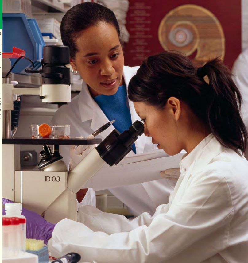
Researchers put health dollars to work at the NIH campus in Bethesda, bringing economic benefit to Maryland.

“Maryland’s life sciences industry continues to be one of our strongest economic drivers, creating high-paying jobs even in tough times and helping to feed, fuel and heal our planet with life-saving discoveries. Together, we can unlock our future potential, while offering moral leadership in an increasingly connected world,” Gov. Martin O’Malley commented.