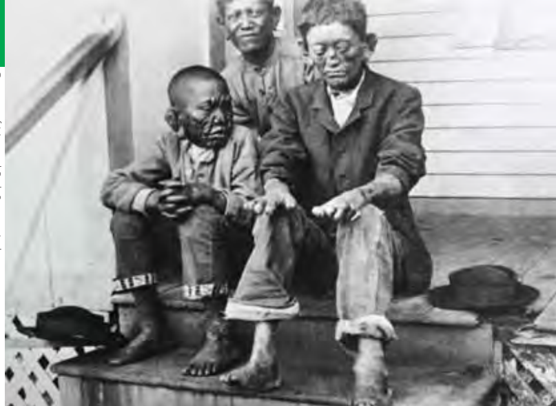
Young Hawaiian boys with leprosy were banished to the remote island settlement of Kalaupapa, away from their families and friends.

say this phrase, something I will never forget. 'This is your last place. This is where you are going to stay, and die.' That's what they told me. I was a thirteen-year-old kid."