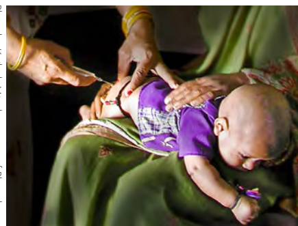
About one-third of malaria drugs tested in Southeast Asia were found to be fakes, according to a Fogarty study.

By studying survey data of the malaria drugs available across Southeast Asia and sub-Saharan Africa, researchers found that from 20 to 42 percent are either poor quality or fake. Poor quality samples were classified as falsified, substandard or degraded. Falsified drugs were fraudulently manufactured with fake packaging and usually no or wrong active ingredient. Substandard products were poorly manufactured with inadequate or too much active ingredient. Degraded supplies are good quality drugs that have been compromised by substandard storage.