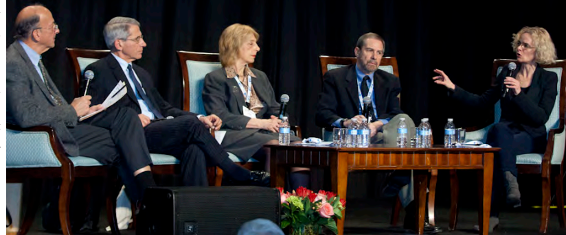
Top NIH officials spoke about their organizations' many successes and opportunities in global health research at the recent Consortium of Universities for Global Health meeting.

There are “phenomenal, unprecedented opportunities” for advances in global health research, the NIH director recently told attendees at the Consortium of Universities for Global Health annual meeting in Washington, D.C.