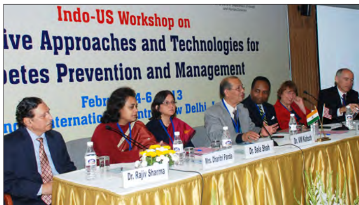
Delegates from the U.S. and India flesh out plans to jointly research diabetes, a rising problem in both countries.