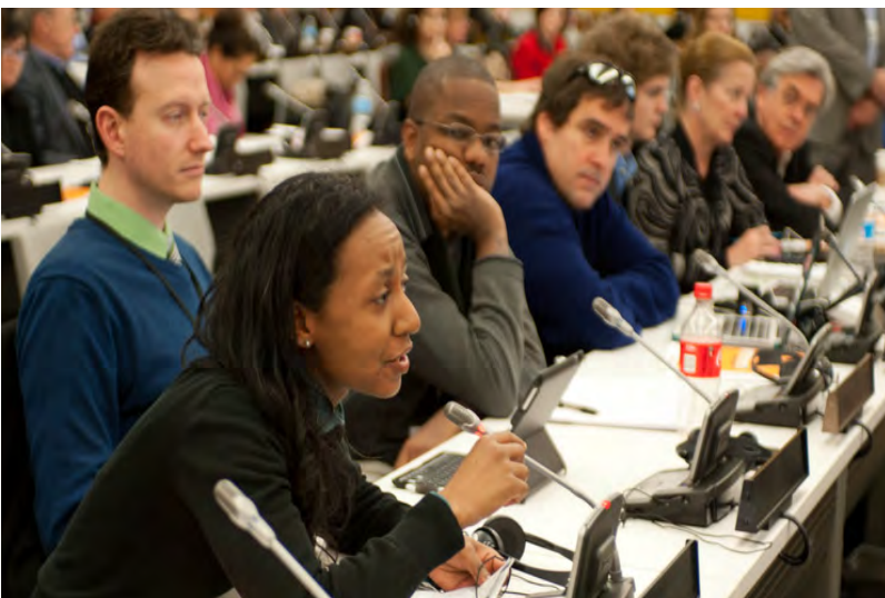
Attendees at the GETHealth summit shared ideas about how to accelerate use of mobile technologies in developing countries.

that facilitates teacher and student online communication and access to multimedia materials, correspondence,