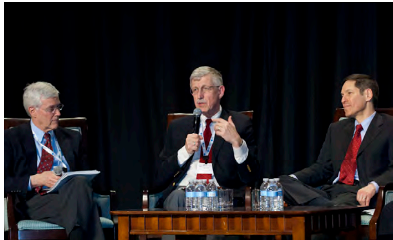
Research expertise must be built in developing countries to take advantage of the "unprecedented" opportunities, NIH Director Dr. Francis S. Collins (center) told attendees of the 2013 Consortium of Universities for Global Health meeting.