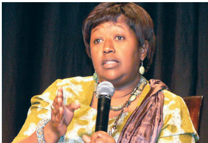
Partnerships are needed to build research capacity in a sustainable way, Rwandan Health Minister Dr. Agnes Binagwaho told attendees of the recent Consortium of Universities for Global Health conference.

One barrier to dissemination is developing country scientists' lack of access to current research findings. Binagwaho encouraged open-source publications noting that, otherwise, people in partner countries pay half their salaries just to read the latest journal articles.