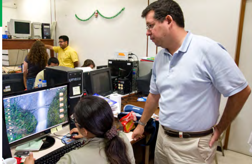
Fogarty’s new program will build technology expertise in developing countries.

to adapt and develop their own courses or learning platforms to best fulfill their training and research needs.”