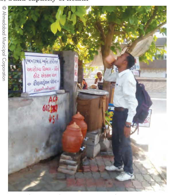
Researchers are studying interventions, such as water stations, to see if they reduce deaths during heat waves.

The research guiding the adaptation effort was partially funded by the National Institute of Environmental Health Sciences, with additional support from Fogarty.