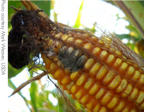
Aflatoxin-infected crops, mostly found in developing countries, can cause liver cancer.

hepatitis B, longtime exposure to aflatoxins, and increased risk for liver cancer. The drug Oltipraz can counteract the poison and reduce the amount of aflatoxins circulating in the body, research shows. Investigators have also been examining chlorophyllin, a derivative of chlorophyll, the green pigment in plants, as a treatment for aflatoxininduced liver cancer. Aflatoxins may also play a harmful role in child development, another research topic.