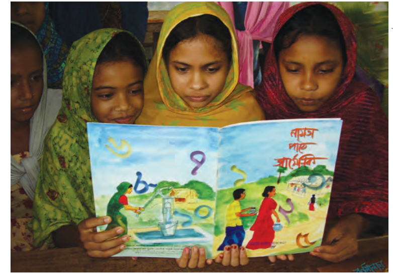
By teaching students to drink from safe wells, the whole family benefits, an NIH-funded study shows.

Students who received arsenic education were five times more likely to switch to a safer well, compared to control groups. The children receiving the intervention also had a significantly greater decline in urinary arsenic, a biomarker of exposure, than the controls. And, there was a substantial increase in knowledge about arsenic after the intervention.